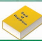
Book of Happiness