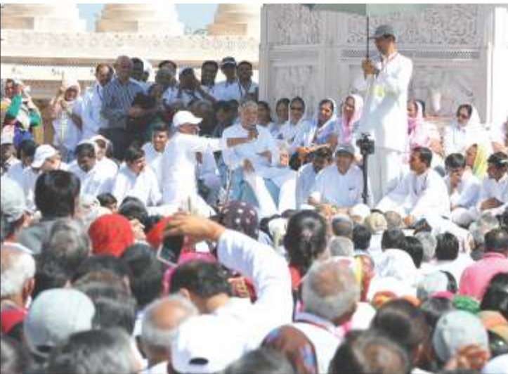
Pujyashree performing vidhi at the temple of Padmavati mata.