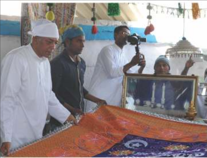
Pujyashree offering Chaadar to Angarshah PeerSahib.